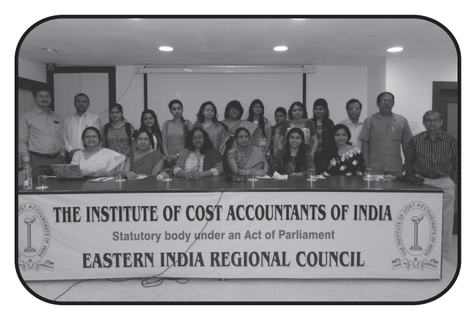
Celebration of Woman's Day